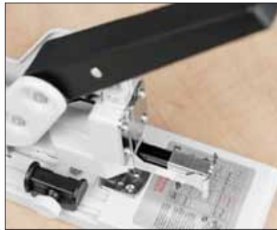
Dual staple guide system provides even pressure on the staple legs until it clinches your documents.