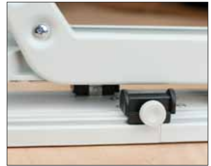
Adjustable depth guide ensures you staple at the desired depth each and every time.