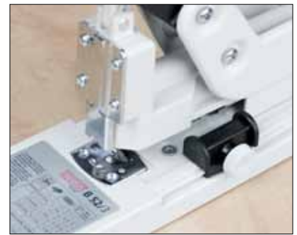
Adjustable depth guide ensures you staple at the desired depth each and every time.